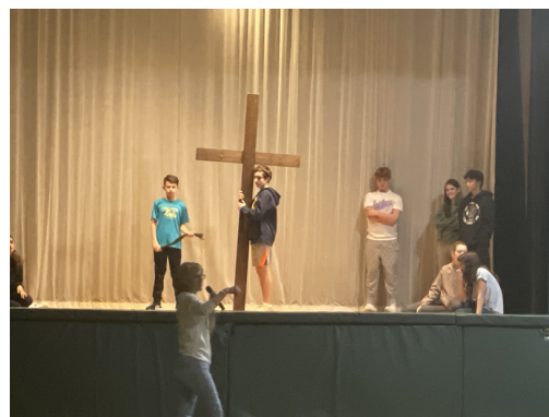
St. Louise de Marillac School