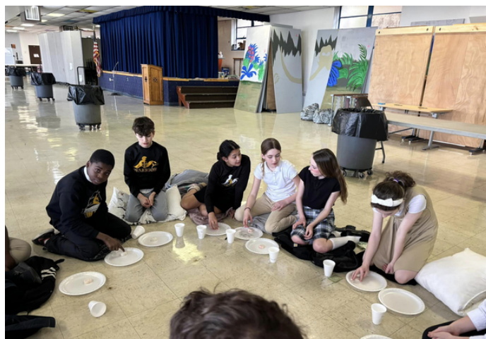
Guardian Angel Academy Japanese Club Fun!