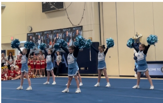
Ave Maria Academy AMA Cheer Competition!