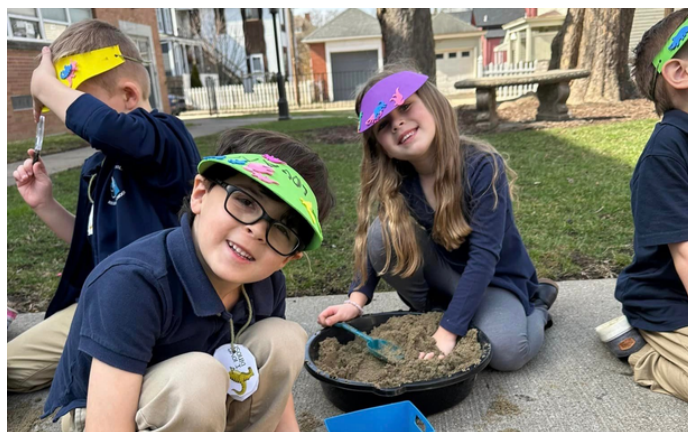
Madonna Catholic Kindergarten Paleontologists!