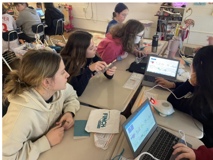
John F. Kennedy Catholic School Finch 2.0 Coding and Robotics!