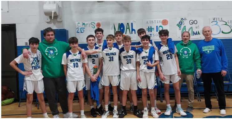
Mother of Mercy Academy Basketball Semi-Finals!