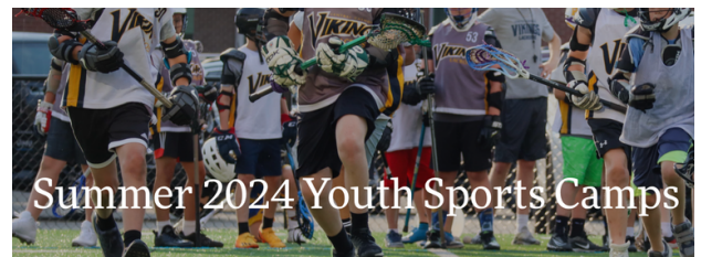
Summer 2024 Youth Sports Camps

For more information, visit: https://bishopcanevin.org .