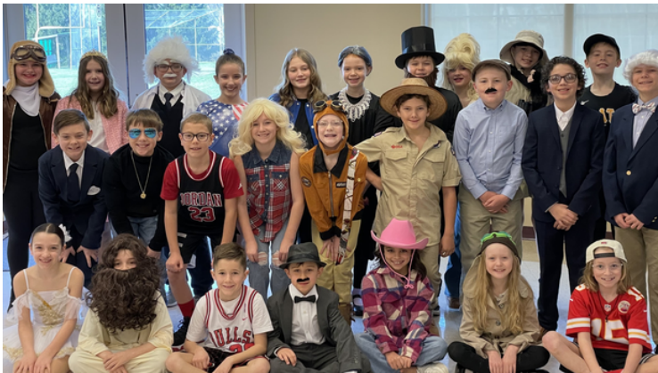
St. Louise de Marillac Catholic School 4th Grade Biography Book Reports!