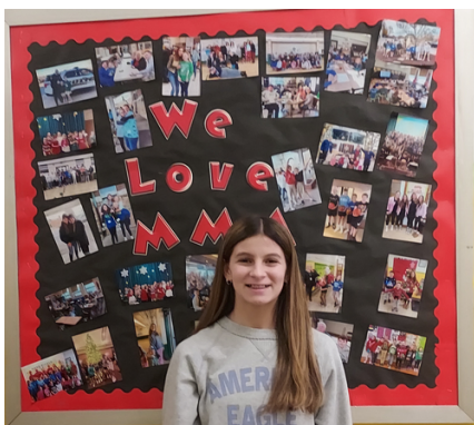
Mother of Mercy Academy